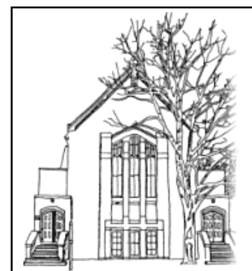
Church of the Resurrection

Folks at The Rez have a genuine heart for caring for the poor in our neighborhood and in our city. Along with supporting the work of Sanctuary financially, with regular collections of water, socks and other much-needed supplies, members of the congregation have participated enthusiastically in Operation Christmas Child, in the Toronto Star's Star Box campaign and in the Out of the Cold program at the neighbouring parish of St. Brigid's Catholic Church.